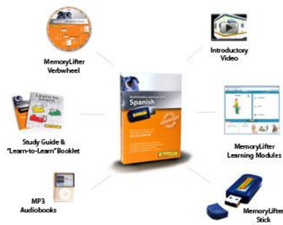
Multimedia Learning Suite: Spanish