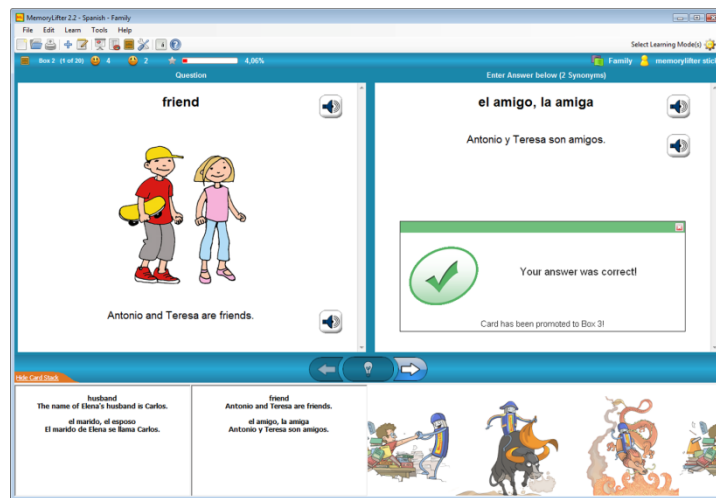
MemoryLifter Learning Environment